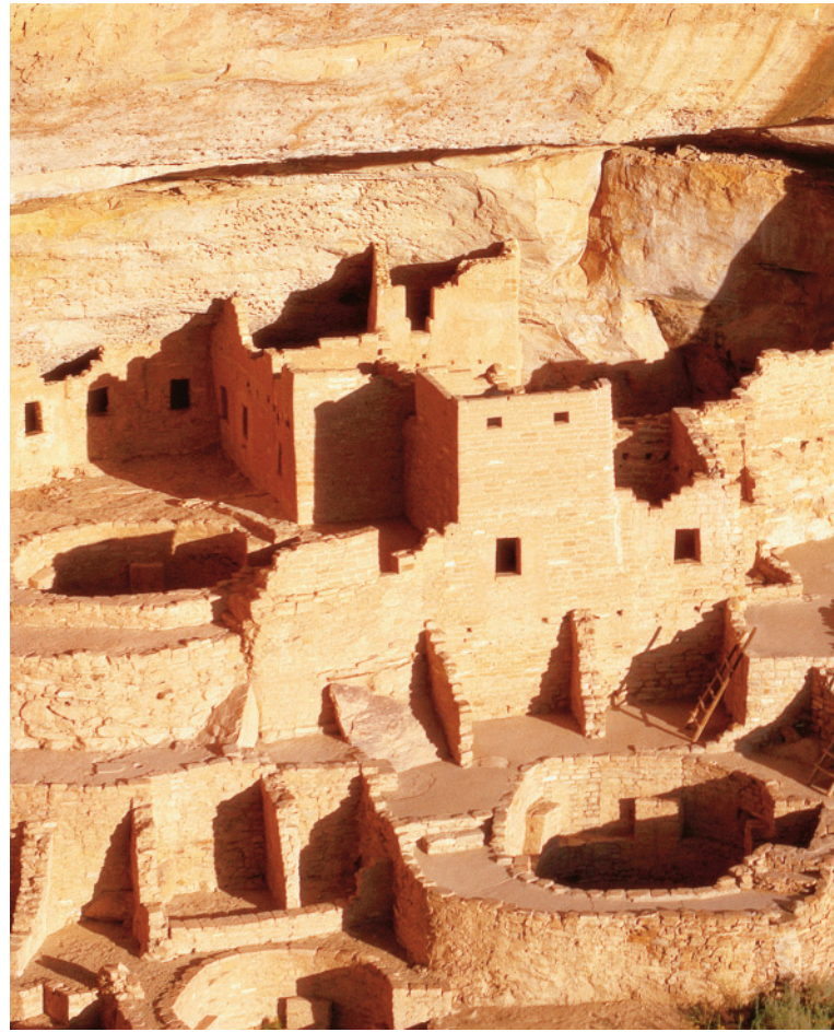
▲ Cliff Palace, Mesa Verde, had 217 rooms and 23 kivas.

Many Anasazi pueblos were abandoned around 1200, possibly because of a prolonged drought. The descendants of the Anasazi, the Pueblo peoples, continued many of their customs. Pueblo groups like the Hopi and Zuni used kivas for religious ceremonies. They also created beautiful pottery and woven blankets. They traded these, along with corn and other farm products, with Plains Indians to the east, who supplied bison meat and hides. These nomadic Plains tribes eventually became known by such names as the Comanche, Kiowa, and Apache.